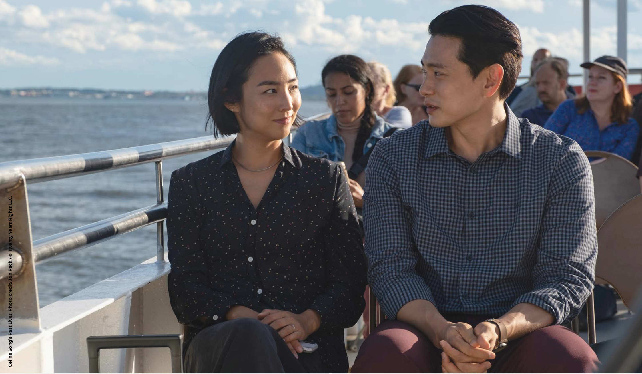
Celine Song's Past Lives.